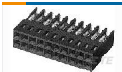
TE Part # 102394-2 08 AMP MODU MT HSG DR .100CL